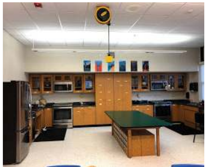
Career and Technical Education Room After