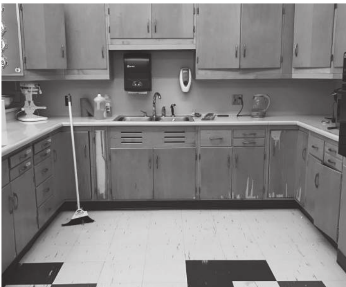
Jr/Sr HS Family Consumer Science Room Before

We will highlight some of the renovations in this issue and follow up with others in future editions of Joyful Echoes .