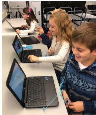
STEM Lab After