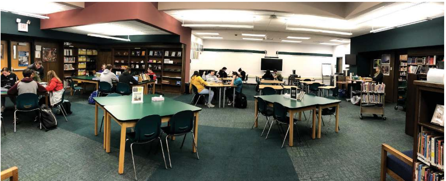
Jr/Sr HS Library Renovations