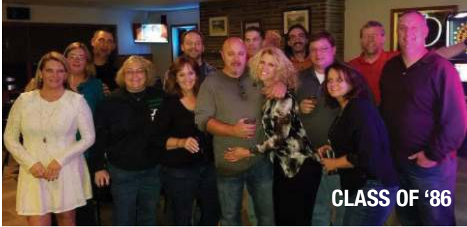
CLASS OF '86

The Class of 1986 had its 30th reunion on October 14-15. Over 30 classmates attended the various events on homecoming weekend.