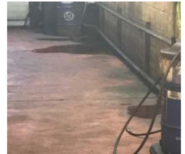
Drainage Issue in the Bus Garage

Visit the Capital Project page on the District Website for more project details and regular updates: http://www.ocs.cnyric.org/district.cfm?subpage=62732